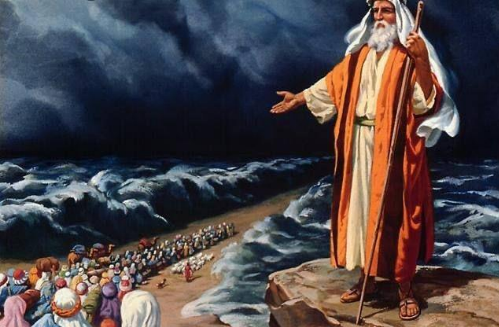
The New Exodus