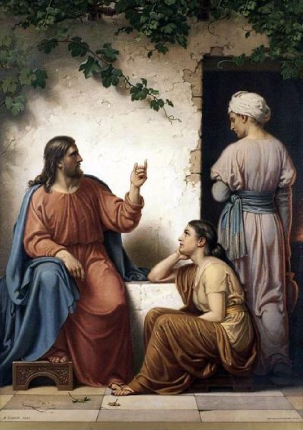
Jesus, Mary, and Martha by Anton Laurids Johannes Dorph